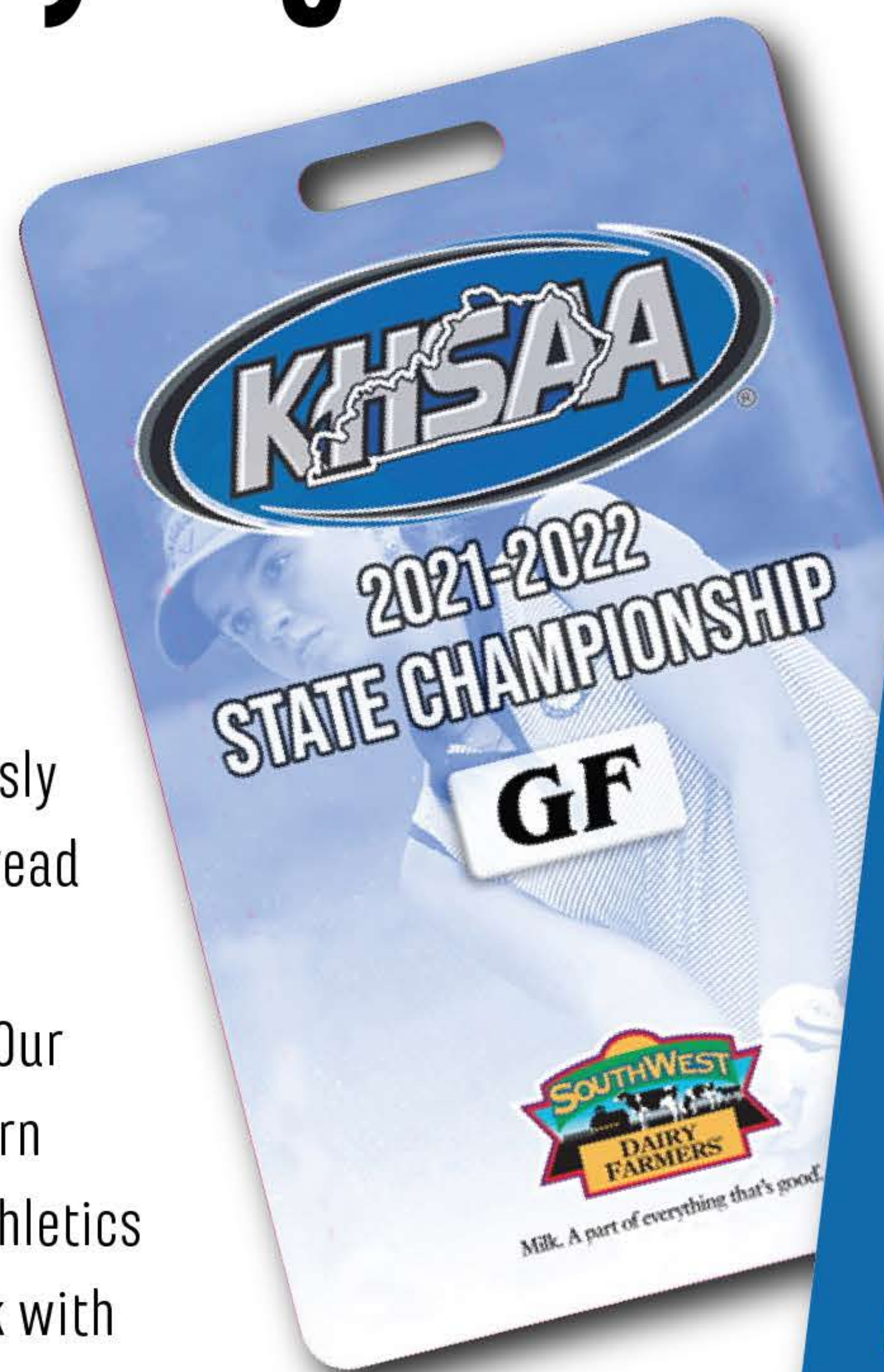
Front and back of lanyards that were passed out to 25,000 state qualifying high school athletes in the state of Kentucky.