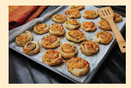
Football Games and Party Roll-Ups go hand in hand. This recipe will make your crowd go wild!